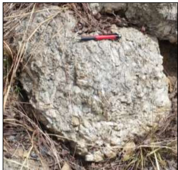
Coarse grained "crowded" spodumene rock at Goulamina