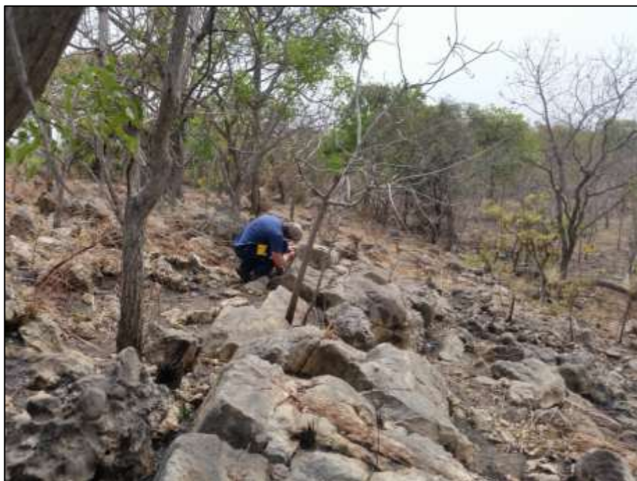
Goulamina Hill, showing a portion of the outcropping Goulamina Pegmatite.

Mineralisation is approximately 55 metres wide at this location, and dips steeply to the east (left of picture)